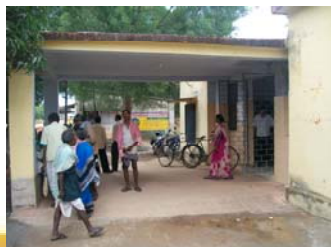
Garposh CHC →