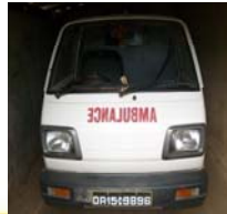
Ambulance of Jujumura