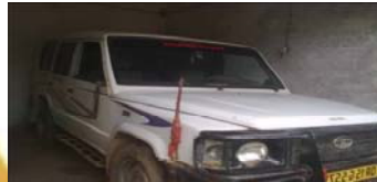
Janani Express -Naktideul