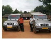
Janani Express of Jujumura