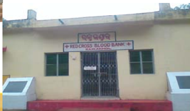
Blood Bank ,Raikhol----