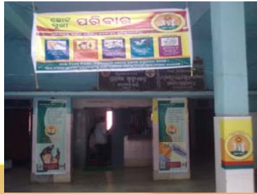
SAB Training at DHH,Sambalpur & SDH,Kuchinda