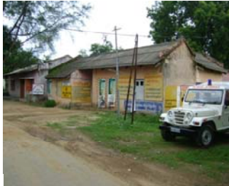
Ambulance at Garposh