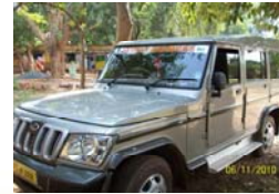
Janani Express of Laida