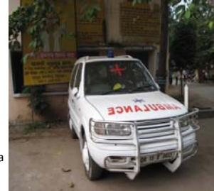
Ambulance at Sambalpur