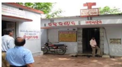
---Blood Bank ,Sambalpur